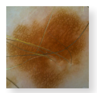
Polarized 50x, Reticular pattern

The system is very easy to use and provides sharp and detailed images with accurate color representation. Patients' data is encrypted in a secure data base and can only be accessed by authorized personnel.