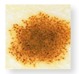
Polarized 20x, Globular pattern