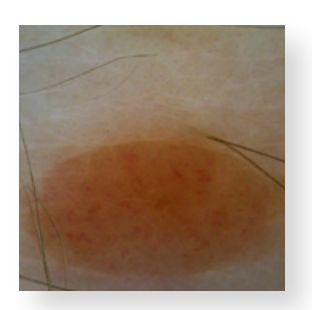
Polarized 50x, Lacunar pattern